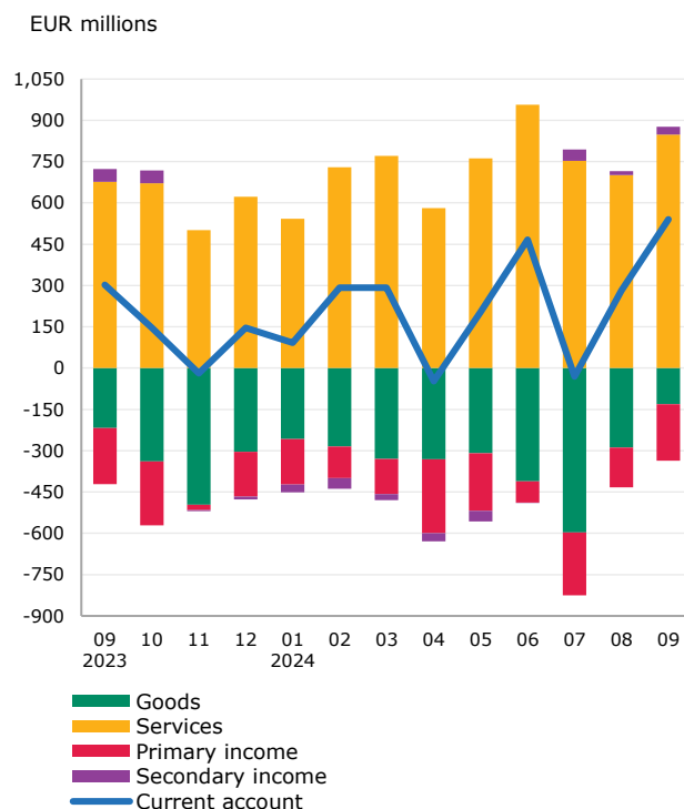
Chart 1. CAB and its composite flows

the positive net flow of financial account investment (€1.0 billion) was mainly driven by the positive net flow of portfolio investment (€867.1 million) and other investment (€308.8 million), which offset the negative net flow of direct investment (€117.6 million) (see Chart 2).