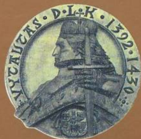
Medals "Vytautas", designed by sculptor V. Kašuba, 1975

Information is available at the Bank of Lithuania Tel. (370 2) 68 03 16 Fax (370 2) 68 03 14 http: //www.lbank.lt