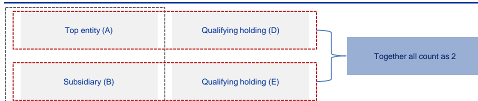
Figure 2 Counting of multiple directorships