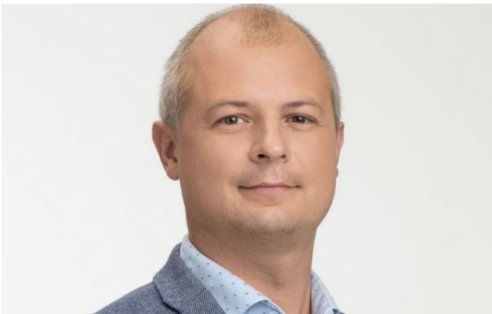
Simonas Gentvilas , Minister of Environment of the Republic of Lithuania. Simonas Gentvilas was born in Vilnius. He attended Vytautas Magnus Gymnasium in Klaipėda and Karlskrona Gymnasium in Sweden (from 16 years). Simonas completed the bachelor's studies in Sociology at Oslo University and the master's programme in Urban Studies at Vienna University. Four years ago, he completed the Swedish Institute Management Programme dedicated to professionals from Eastern European countries. Simonas Gentvilas knows 7 foreign languages: English, German, Russian, Spanish, Norwegian, Danish and Swedish.

Professional activities of the new Minister of Environment before 2016, when he was elected to the Parliament of Lithuania, were mainly related to the city of Klaipėda. There he worked as Advisor to the city's Mayor and Executive Director of the Association of Municipalities of the Klaipėda Region, founded the Baltic Institute of Technology and lectured at the University of Applied Social Sciences.